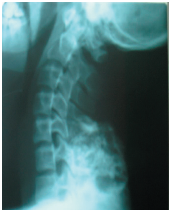
Figure 1. X-Ray of the cervical spine demonstrates the mass related with C6 vertebrae.