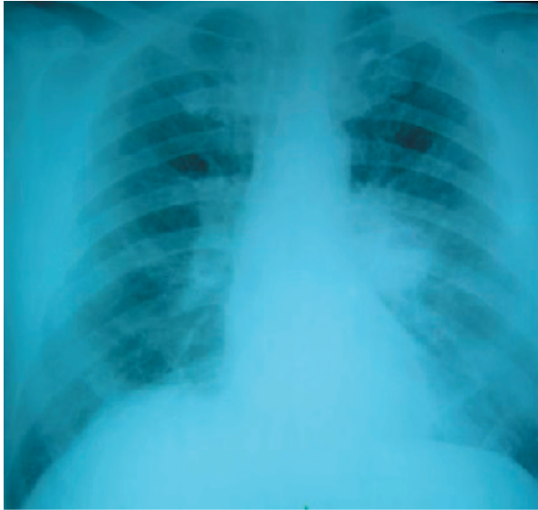
Figure 1. Posteroanterior chest radiography showing central lesion