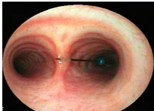
Figure 3. A headscarf pin in the right main bronchus