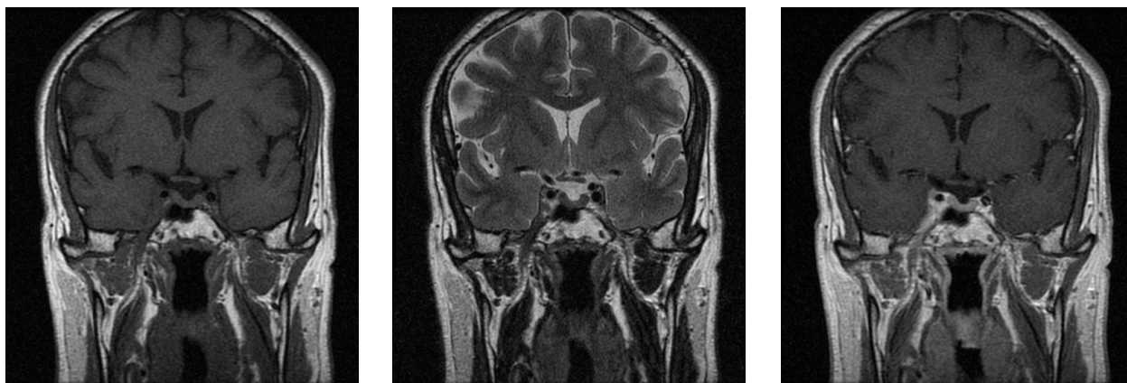
Figure 1. There is expansion of the right cavernous sinus with signal change which is isointense to muscle on T1 (Figure 1A) and T2-weighted (Figure 1B) images. There is prominent heterogenous enhancement after intravenous contrast administration (Figure 1C). The cavernous segment of the right internal carotid artery is narrowed. Please note some mild heterogeneity in the cavernous sinus around the left internal carotid artery.

migraine. The patient was transferred to our hospital. The neurological exam demonstrated ptosis, dilatation of the right pupil, hypoesthesia of ophthalmic, maxillary and mandibular branches of the trigeminal nerve on the right side. There was partial restriction in the eye motions when looking into outside and upward. The eye movements were free on the left side. There was no facial asymmetry. The laboratory findings were in normal limits. Gadolinium-enhanced MRI exam of the brain and pituitary gland were obtained. There was expansion of the right cavernous sinus with signal change isointense to muscle on T1 (Figure 1A) and T2-weighted (Figure 1B) images. There was intense heterogenous enhancement after intravenous contrast administration (Figure 1C). The findings were found to be consisted with Tolosa-Hunt Syndrome. A mild heterogenous signal change was also noted in the cavernous sinus around the left internal carotid artery. Adenohypophysis was normal. The patient was given 1 g prednol intravenously. Then, 80 mg / day oral prednol was started. The headache of the patient significantly reduced in 48-72 hours. Partial improvement in the eye movements was observed at that time. Within a week ophthalmoplegia disappeared. The steroid dose was decreased in 2 months, and stopped. There was no relapse in 1.5 year follow-up.