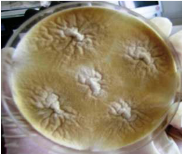
Figure 1. Colony morphology of P. variotii